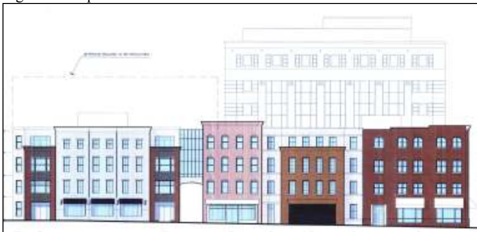
Figure 11: Montgomery Street Elevation

There is more variety in building scale and typology along Montgomery Street, but many of the elements shown display the same sense of oversimplification or abstraction and lack of detail as their counterparts on Washington Street. The use of a building facade, rather than a building break, to contain the garage entrance also does not seem to work here, as it negates the small (32' wide) building facade in which it is placed. Once again, the perception of smaller buildings as mere facades pasted on a larger backdrop is not appropriate, and there is lack of detail, especially at the building base and pedestrian level.