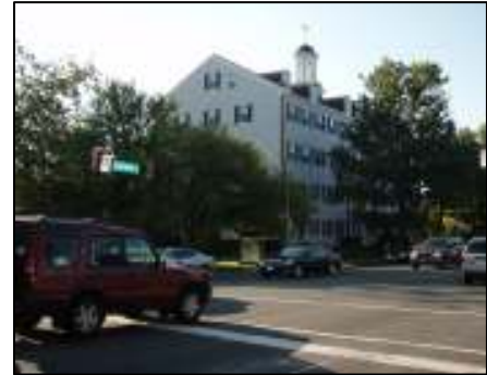
Figure 3: Cotton Factory