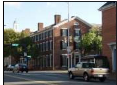
Figure 4: Lloyd's Row