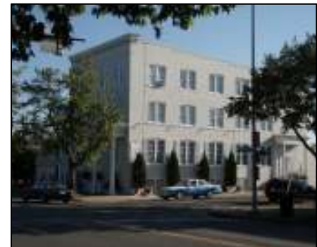
Figure 5: Demaine Funeral Home