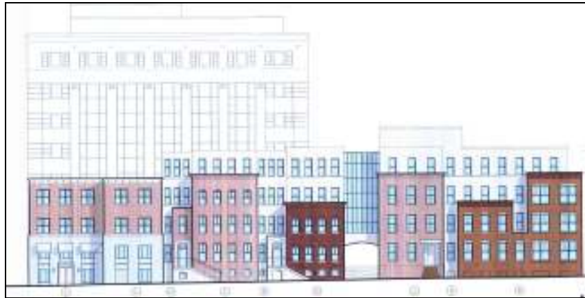
Figure 12: First Street Elevation