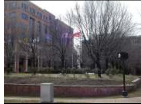
Figure 8: Existing AFBA Building