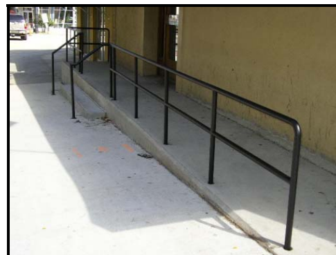
Photo of an open metal handrail