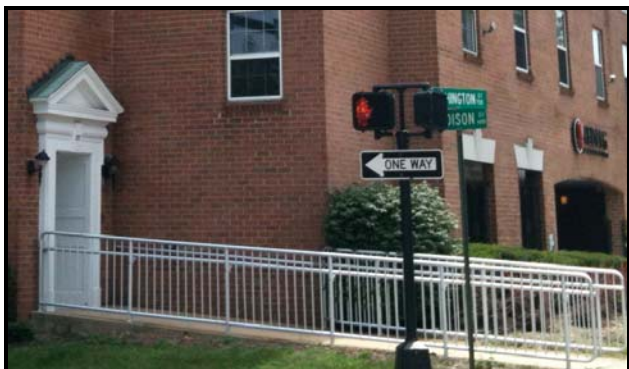
Photo of existing white metal balustrade

Due to the building’s size, the size of the signage, and the proposed location facing a gas and service station, Staff maintains that a second, unlit metal flat sign located above the third story windows is appropriate and compatible for the Madison Street elevation. However, Staff is concerned with the prominent appearance of the existing white metal railings installed flanking the handicap ramp on the first level. Staff has not been able to document a BAR approval for the installation of this incompatible guardrail style balustrade and is recommending that it be removed and replaced with visually minimal, black metal handrails. Balusters are not needed in this application and draw far too much attention to the ramp.