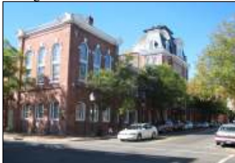
Figure 13. City Hall