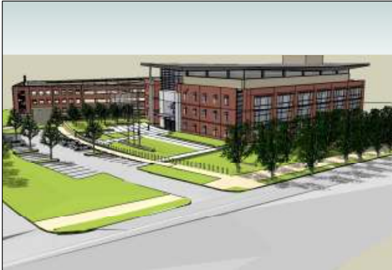
View from Wheeler Avenue looking south.