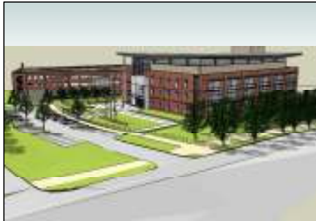
Figure 12. View from Wheeler Avenue