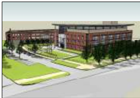
Figure 5. View from Wheeler Avenue

The program for the proposed police facility includes an 119,000 sq. ft., four-story building to house approximately 540 sworn and support staff. The building is approximately 50 feet tall and has a floor area ratio of 0.87. The lower level of the facility is entirely below grade and contains an exercise room, lockers and shower areas, offices, interview rooms, report writing space, and storage. The first floor is at grade and contains a public meeting space, reception area, fingerprinting, offices, conference and break rooms, property and evidence space, drug vault, storage, and technical support. The second level consists of offices, a library, laboratories, interview rooms, and imaging spaces. The third floor houses a break room, interview rooms, offices, and work stations. The state-of-the-art facility also holds a combined police/fire emergency communications center and a modern criminal investigation laboratory.