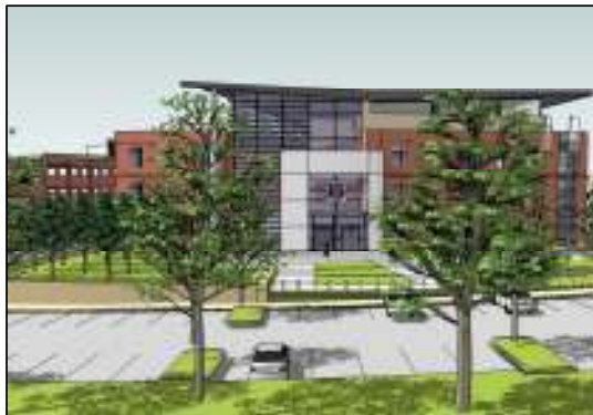
Figure 2. East Elevation